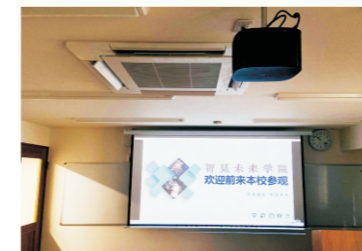
● Classrooms are equipped with projectors and free Wi-Fi in all rooms