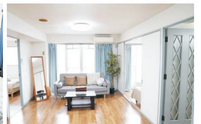
● Dormitory environment (for reference only)