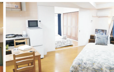
● Dormitory environment (for reference only)